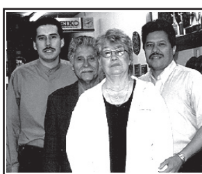
Family-owned with pride by the Macias family since 1967!

1296 West Capitol Ave (at Safeway Center) ♦ 371-6440